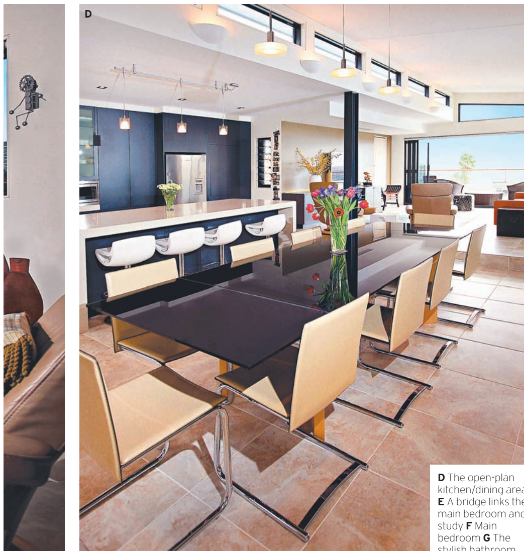
D The open-plan kitchen/dining area E A bridge links the main bedroom and study F Main bedroom G The stylish bathroom