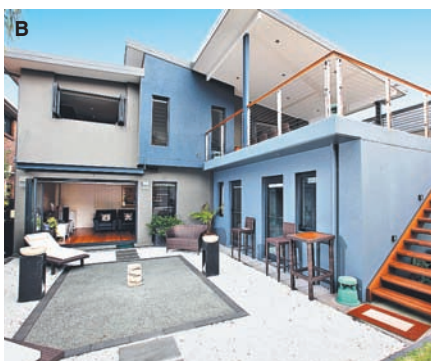
A The home's impressive facade and entrance B A courtyard contributes to the home's indoor/outdoor flow C The lounge area and deck beyond take full advantage of the spectacular view